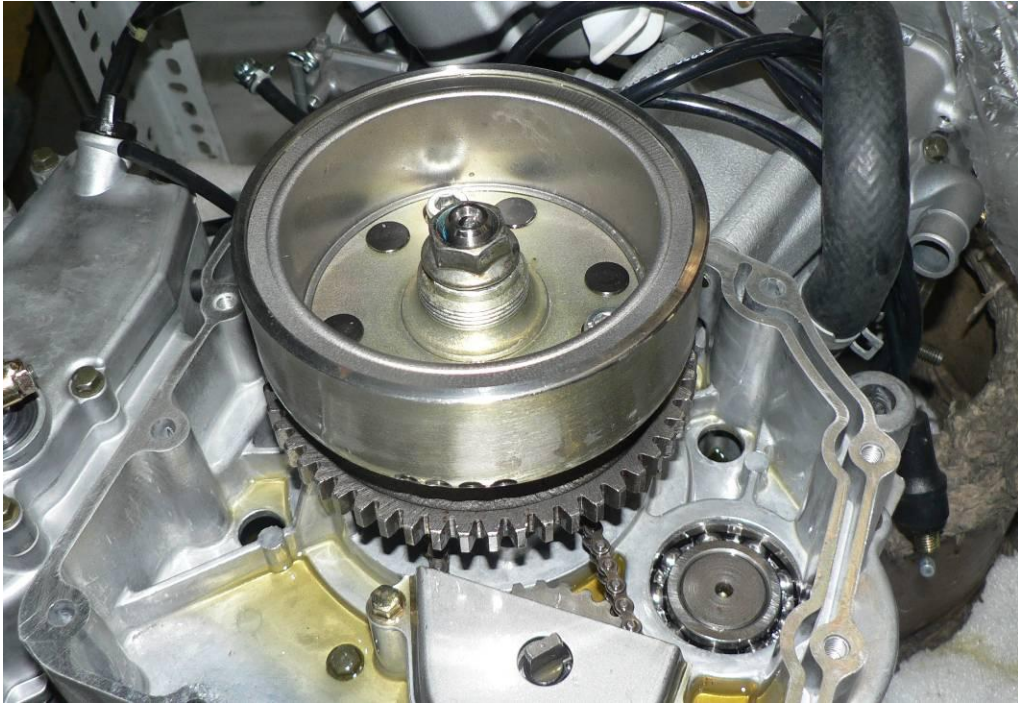
5. Approximate time needed, 15 minutes